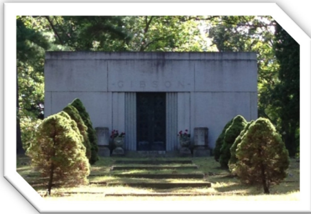
The Gibson Mausoleum

The self-guided tour is designed for a combination of driving and walking, and you can devote as much or as little time to exploring as you want. The tour is free, although voluntary donations are gladly accepted.